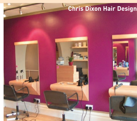
Chris Dixon Hair Design