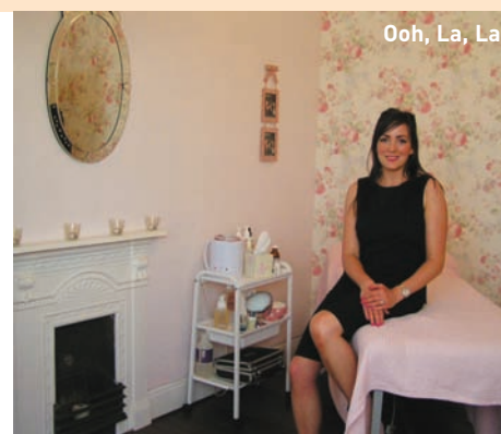
Ooh, La, La

For appointments and further information tel. 01429 894627