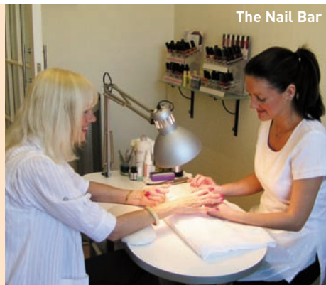
The Nail Bar